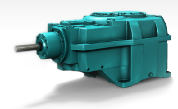
Hansen P4 Mixer Drive

Choosing the correct speed reducer for your mixing application is the key to preventing premature failure and excessive cost. Our Application Engineers, with over 50 years of combined experience, are committed to providing exceptional support to help you select the right mixer drive for your operation. Our team has access to a global network of advanced engineering tools and databases to create detailed reports covering critical aspects of our speed reducers. Reports are available upon request.