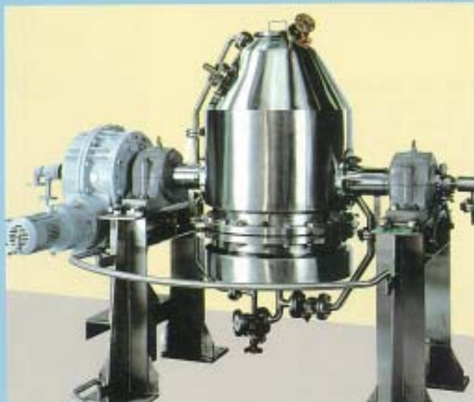
For Filter Dryer