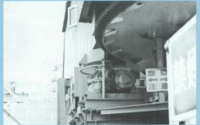
For Rotation of Unloader