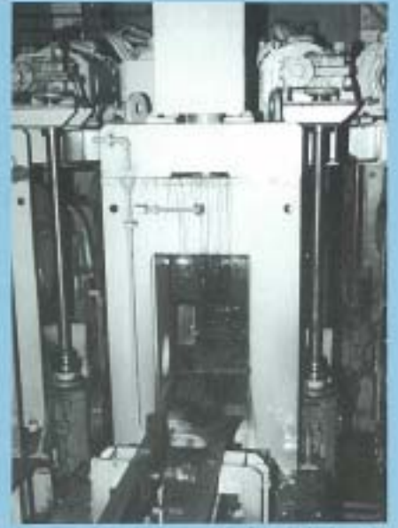
For Pinch Roll