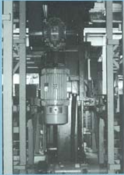
For Automatic Warehouse System