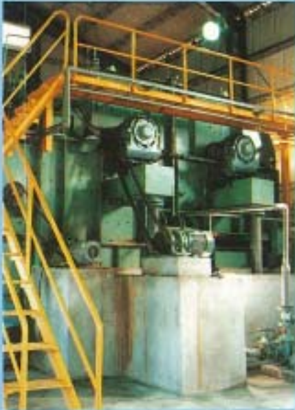
For Filter Press