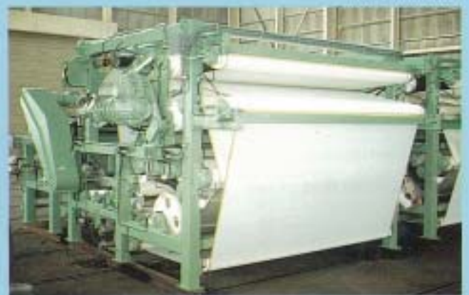
For Belt Press