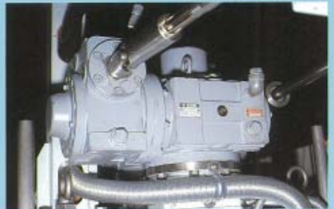
For Steel Belt