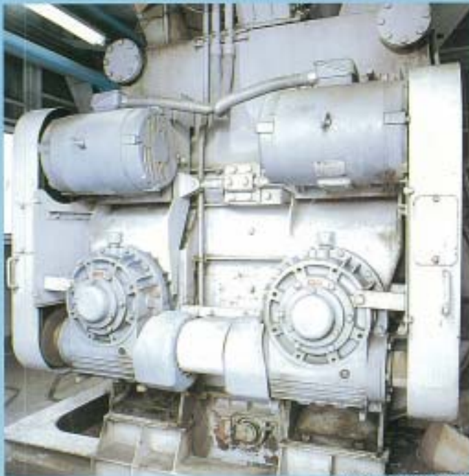
For Concrete Mixer